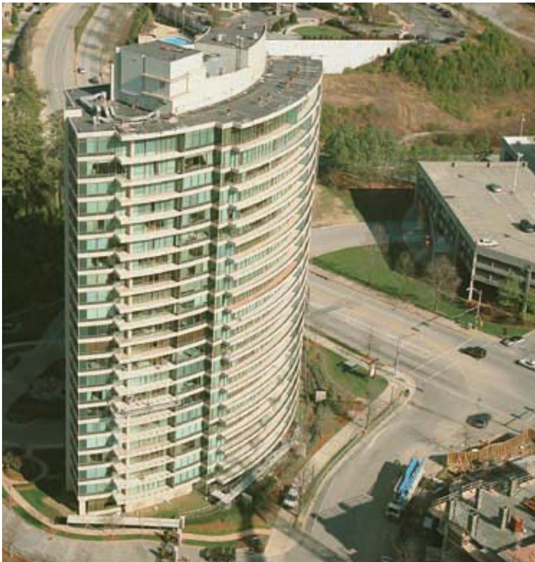
The Park Regency condominiums in Buckhead are one of Morley's show case projects for concrete restoration and waterproofing.

Much of Morley's restoration work follows the designs prepared by local architectural and engineering firms such as Wiss, Janney, Elstner Associates, Inc.; and Williamson & Associates and Penta Engineering.