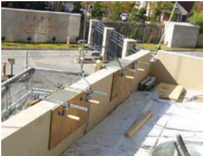
Concrete cures in clamped forms installed by Morley workers in the restoration of balcony walls of the Regency Park condominiums.

Currently, Atlantans can see Morley workers on the Park Regency